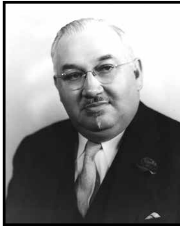
H. Spencer Lewis

How different is all of this from the conservative, limited plan of those who hesitate and fear to build and plan magnificently! It is only through the broadness of vision, through the unlimited heights of our ambitions, and the very greatness of our ideals that we really lift ourselves up and beyond the commonplace. The Rosicrucian organization in America is planned to be in its present cycle just