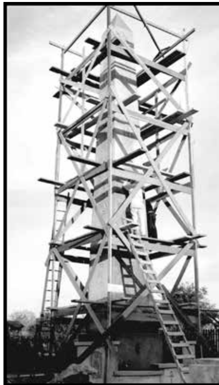
H. Spencer Lewis on "Reaching the Roof": "I allowed my mentally-created structure to tower into the skies to enormous heights..." symbolized by Rosicrucian Park's obelisk in the process of being placed into position, 1937.

like. In fact, I never felt sure that there was a roof upon this mental structure or that a roof was even necessary, for it seemed to me that the only thing to consider was